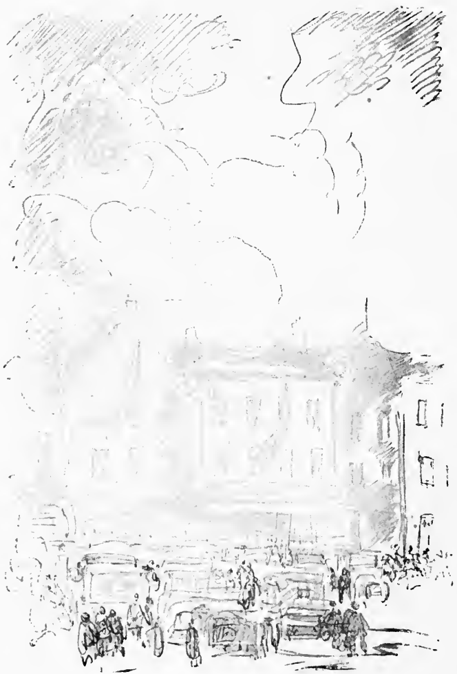
AS WE CROSSED THE PUBLIC SQUARE THE AMBULANCES WERE LINING UP IN BATTLE ARRAY [Page 235]